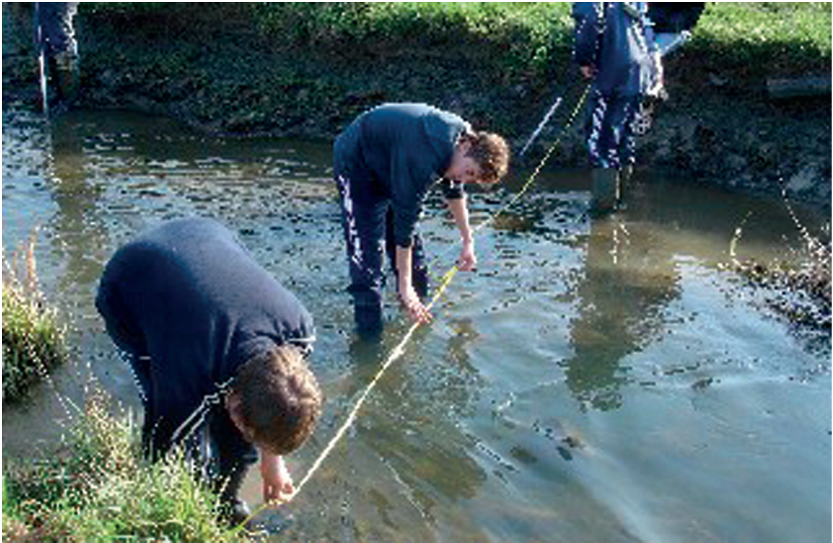
Photograph B for Question 1